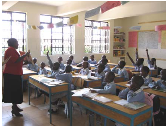
A class at the St. James Primary School in Dandora.

St. Joan of Arc Parish Kenya Konnection Committee 61 Canal Road