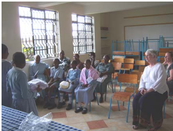
Our scholarship students with their mothers at the St. James School.