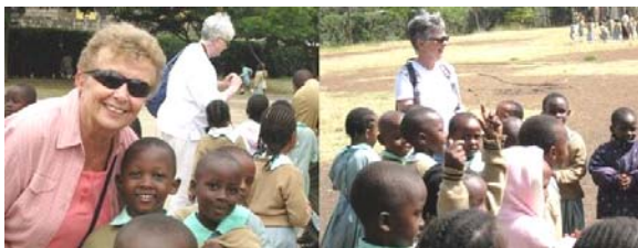
St. Joan of Arc Parishioners in Dandora with some of the children of Holy Cross

In 2010, three of our parishioners, at their own expense, travelled to Dandora in what we expect to be the first of many visits to expand our spiritual connection.