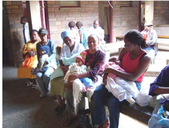
Participants in the Mother and Child Health Program in the waiting room at the Brother André Dispensary at Holy Cross Parish.

Holy Cross Parish is a true center of the Community, offering worship, school, health, and community services.