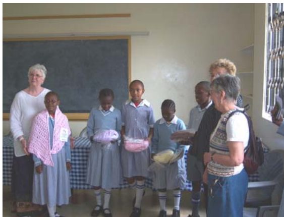
The children we support with scholarships (as of February, 2010) with the shawls knitted for them by the St. Joan of Arc Prayer Shawl Ministry.

We support children in the St James Primary School at Holy Cross with scholarships. Since 2008, the Women's Guild has provided two scholarships, and additional children are supported through parishioner contributions. Beginning in the 2011 school year, we will provide six scholarships, which include tuition, books, uniforms, and meals.