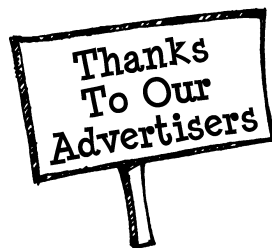
© J. S. Paluch Co., Inc.

A BIG thank you to the business and professional offices who help make this weekly bulletin possible by advertising on the back page year-round. Please take some time to look over our bulletin ads and when you patronize those businesses or services, thank them for supporting our parish in this way.